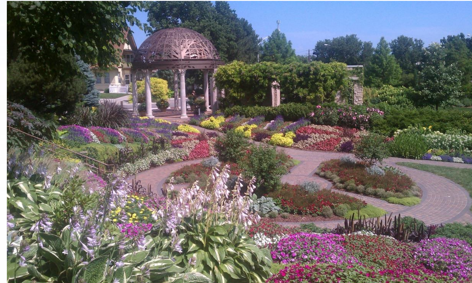
Immerse yourself in the Sunken Gardens

Find your ancestors at the museum for the American Historical Society of Germans from Russia