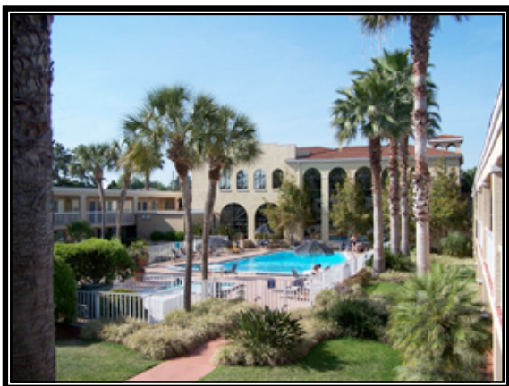
CAMWS members enjoy the Holiday Inn's pool.