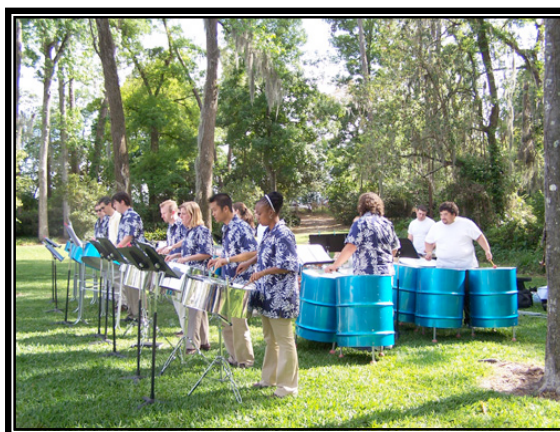
Steel band performs in the UF President's backyard.