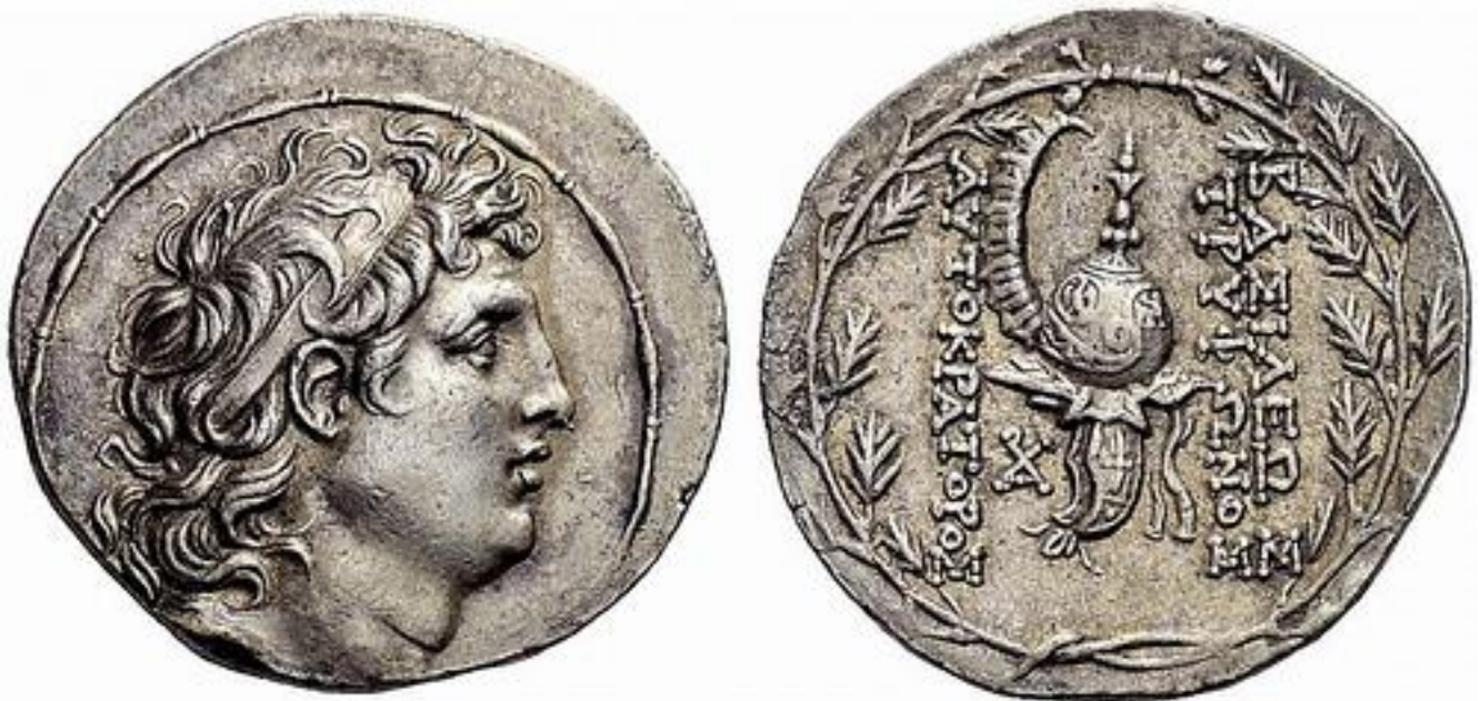
Figure 3: Tetradrachm, Antiochia 142-138, AR 16.64 g. Diademed head r. Rev. ΒΑΣΙΛΕΩΣ - ΤΡΥΦΩΝΟΣ / ΑΥΤΟΚΡΑΤΟΡΟΣ Macedonian helmet with spike, cheek pieces and ibex horn; in inner l. field, monogram. All within laurel wreath border. Houghton, CSE, 256; Seyrig 2; Newell, SMA 264; Babelon Rois 1044.